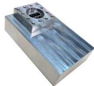
JRE USB 2-1 Filter